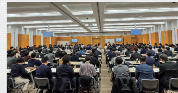
Joint Forum with JICPA with over 200 Participants

A members-only webinar held once a month, featuring 1-2 industry topics with invited speakers. These seminars are often lecture-style or panel discussions, occasionally held offline with social gatherings.