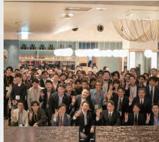
Offline Networking Event with LDP Lawmakers

JCBA's mission is to promote the domestic digital asset industry's growth. This is achieved by leveraging expertise from member professionals in technology, taxation, accounting, law, and business. JCBA conducts research, formulates policy recommendations, engages in advocacy, and fosters talent development to support industry growth.