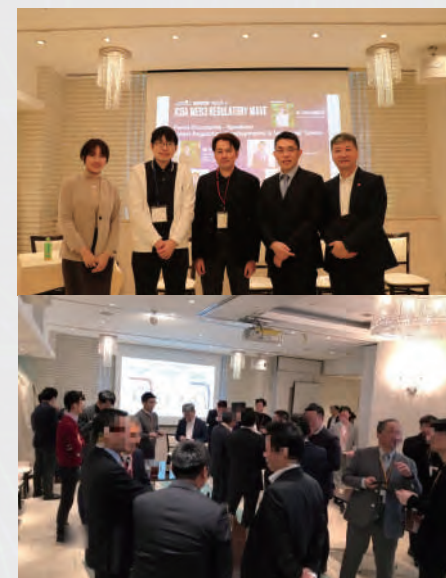
Side Event with Japanese FSA and International Speakers

(December 2023) Published guidelines for regional revitalization DAOs based on case studies and hearings.